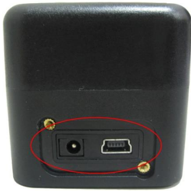
Power connector and mini USB connector